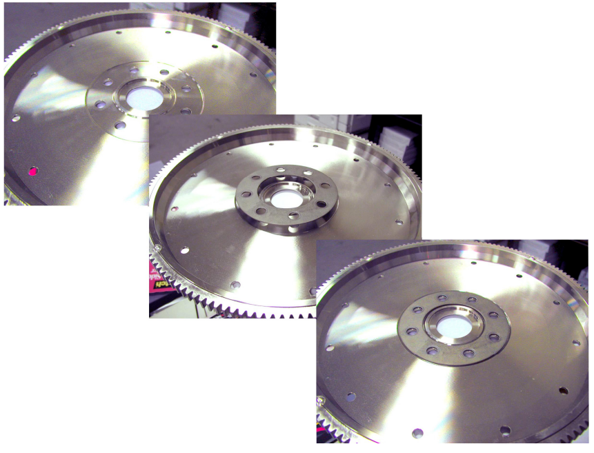
Figure 1: Reuse of the Factory Spacer